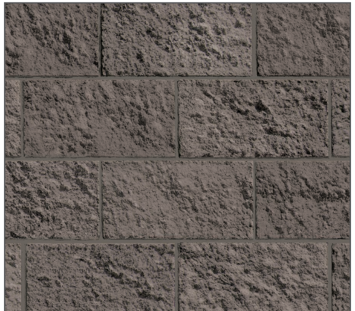
URBANA SPLIT COLOR: SMOKE